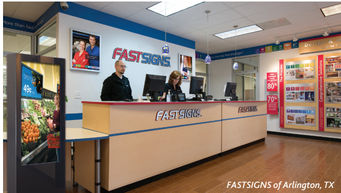
FASTSIGNS of Arlington, TX