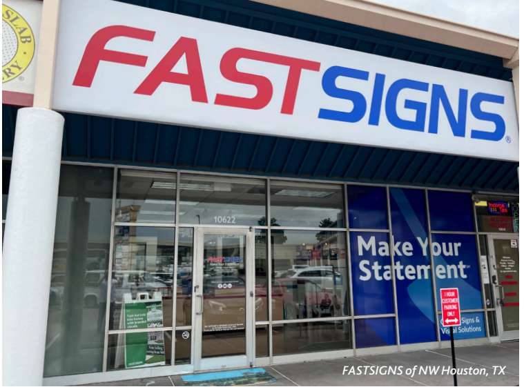
FASTSIGNS of NW Houston, TX