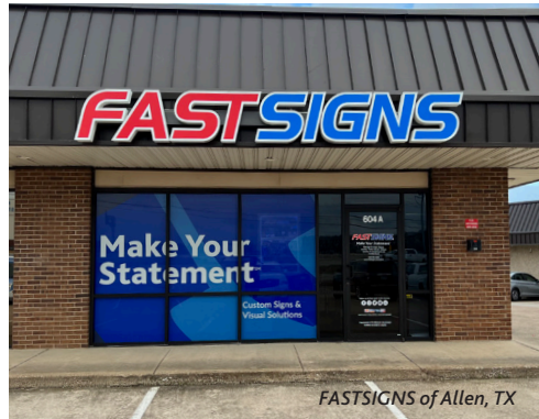
FASTSIGNS of Allen, TX